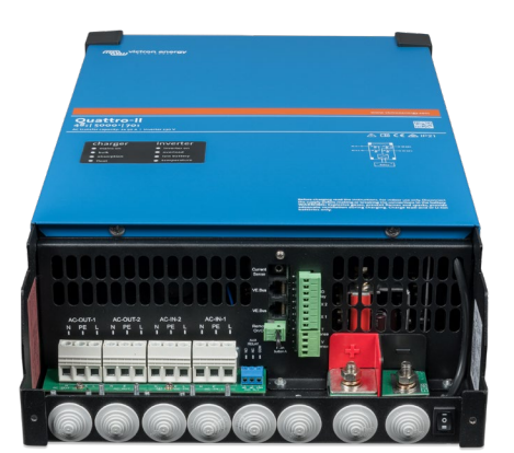
Connection Area Quattro-II 48/5k